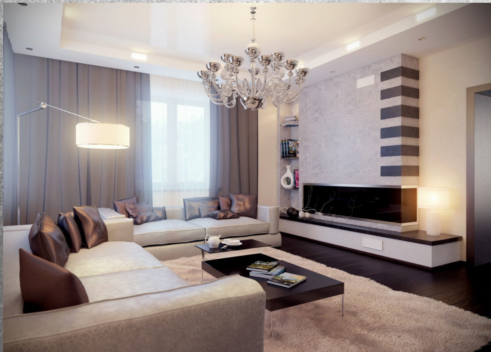
~ Usability and Friendly Interiors ~

Without a doubt Mithila speaks to those who value design and space. Befitting a project dedicated to architectural excellence Mithila is encompassed with all engineering and technological features built to high standards.