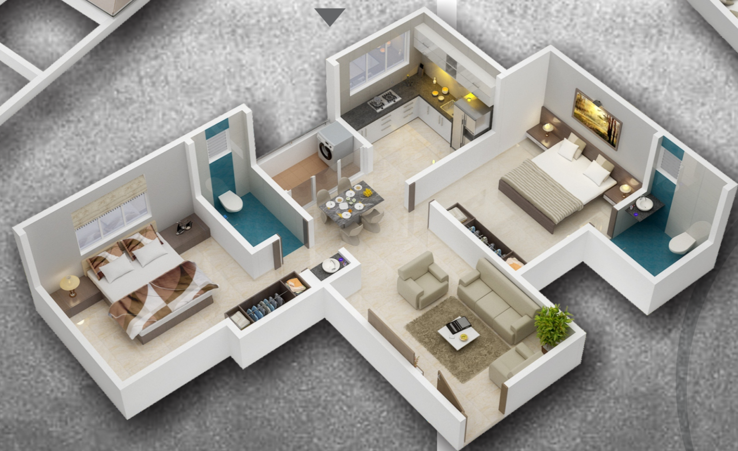
FLAT NO. 102