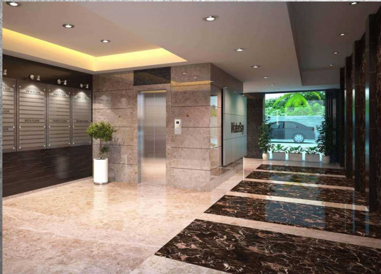
~ Designed Entrance Lobby ~

Style and quality distinguish Mithila from other players. The construction is modern and aesthetic, a masterful blend of eye-catching design and excellent execution. Sturdy and strong, but also subtle and suave. A special creation for the special people who will reside here. A glance at the amenities will convince you that we really care.