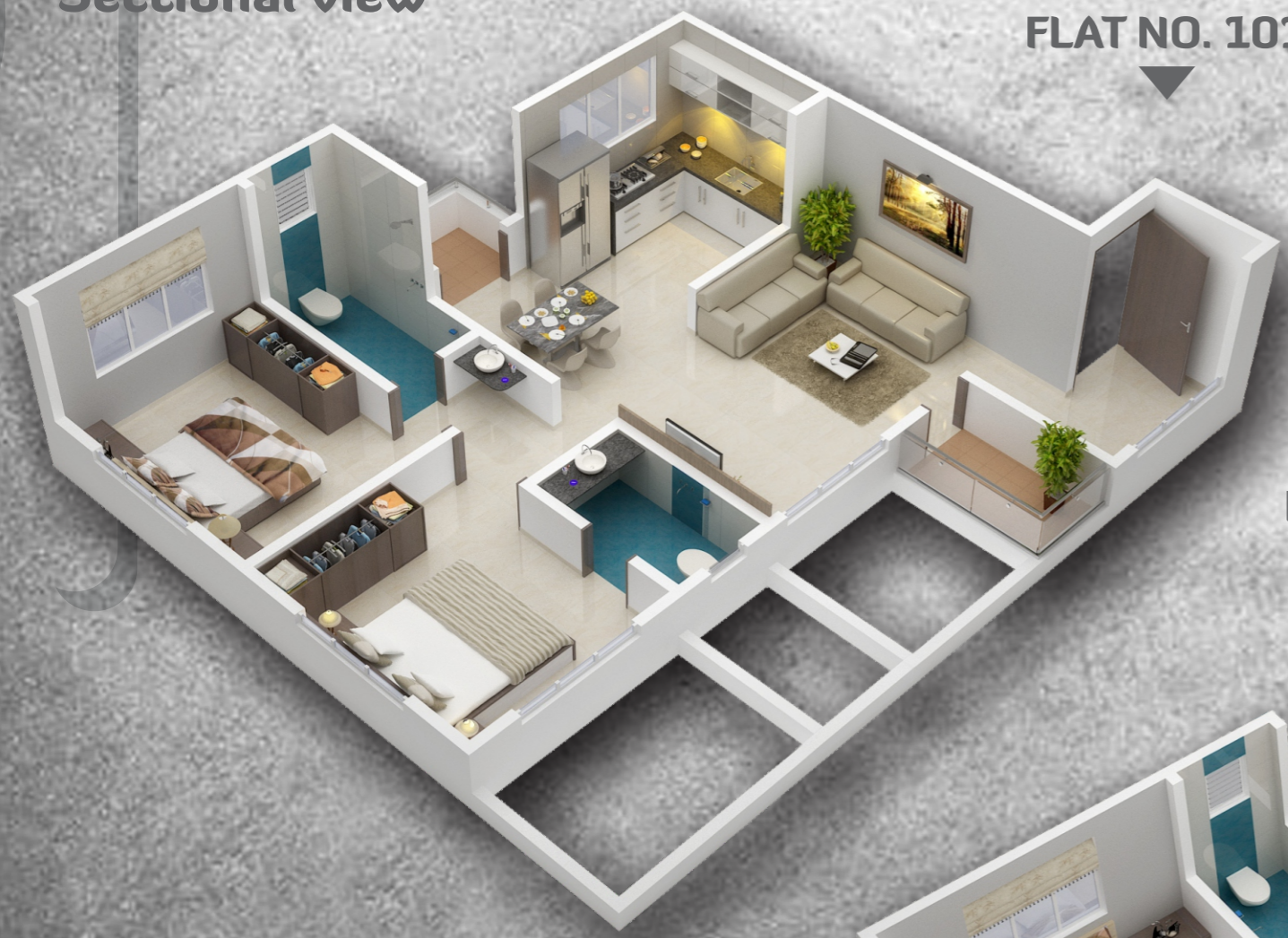
FLAT NO. 101